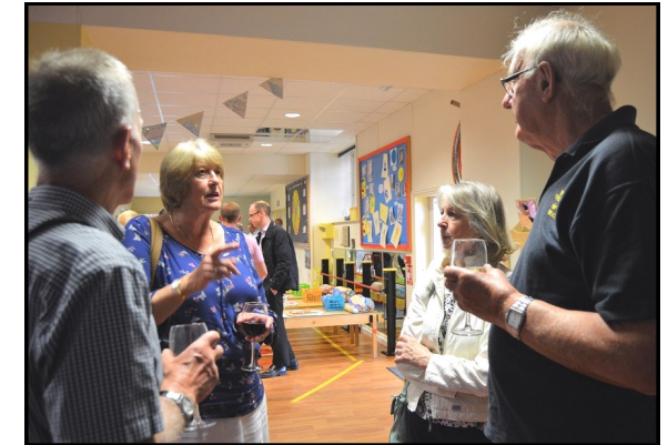
Several club members attended the presentation

Following the presentation, guests were given a tour of the Steps facilities. These are based in a former school, which was purchased in 2006, before being substantially refurbished and adapted in 2007. The project was supported by ITV Central News, and involved 130 local companies who supplied over half a million pounds worth of goods and services free of charge.